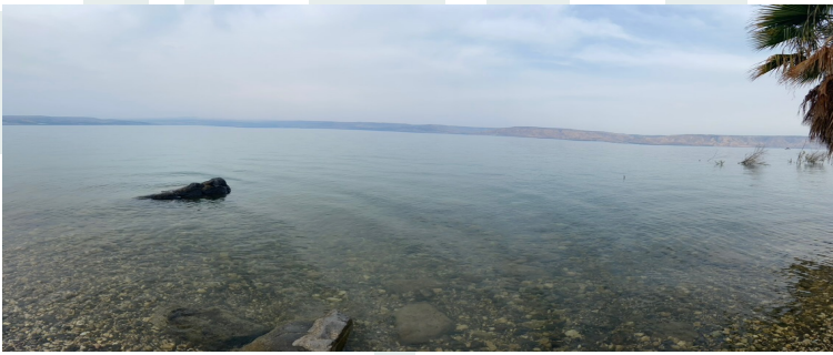
were astonished at the catch of fish that they had taken," (Luke 5:6-9)

The catch, recorded in chapter five of his gospel, is Luke's account of Jesus calling his first disciples. This group of men